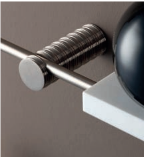
7BW0051X 7L00021X 7N0004F38