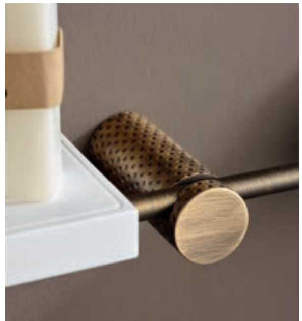
7BW006F34 7L0004F34 7N0001F38